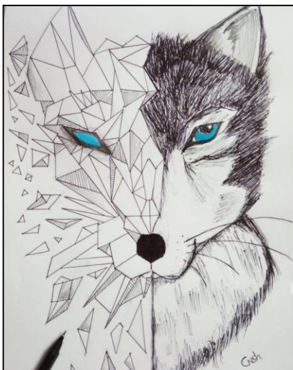
Sinesh V (3 rd Year 2017 Batch)