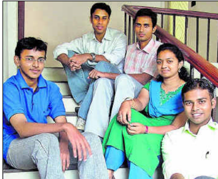
ALL SMILES: Students of Amrita Vishwa Vidyapeetham who have been selected by Microsoft.

Five students from the University have been selected by Microsoft